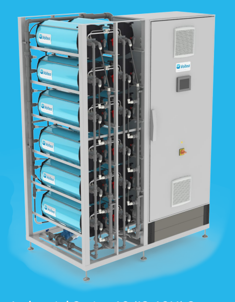
Industrial Series 12 (IS-12H) System

Once wine has been produced it must be packaged. Many may not consider it, but water is also used heavily in this stage for washing, cleaning, and spotfree rinse for quality branding purposes.