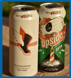
Wellington's first two brews with CapDI purified water!

Due to minimized scaling after the IS-24 CapDI installation, maintenance and labor issues on their brewery system have been reduced, notably the heat exchanges on the HLT. Cleanings were moved from three-times per week down to only once every other week, freeing up their staff to focus on what they are best at; making beer!