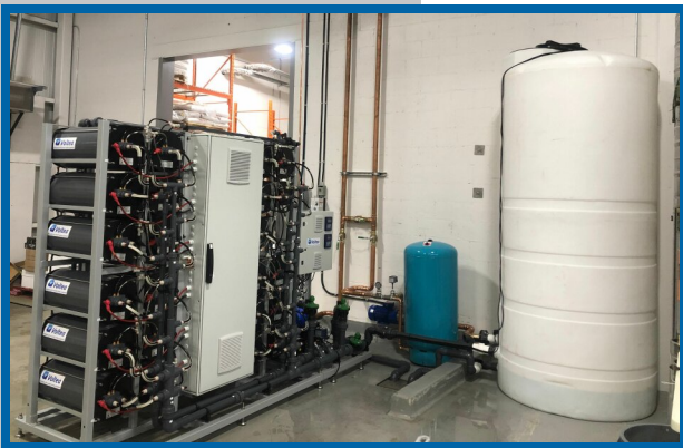
Voltea's IS-24 CapDI water purification complete with pressure and storage tanks at Wellington Brewery